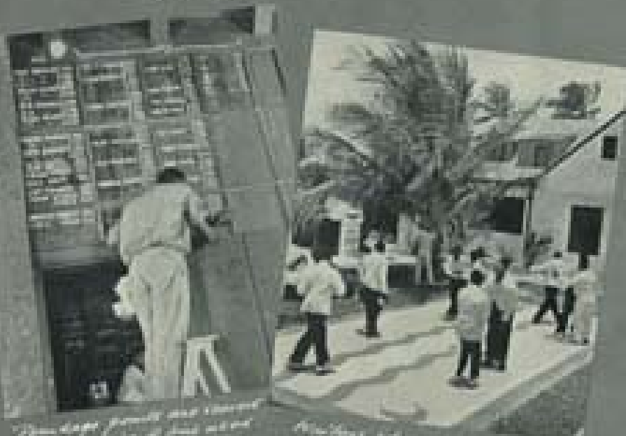
Man steps forward and waves according to code of his island.