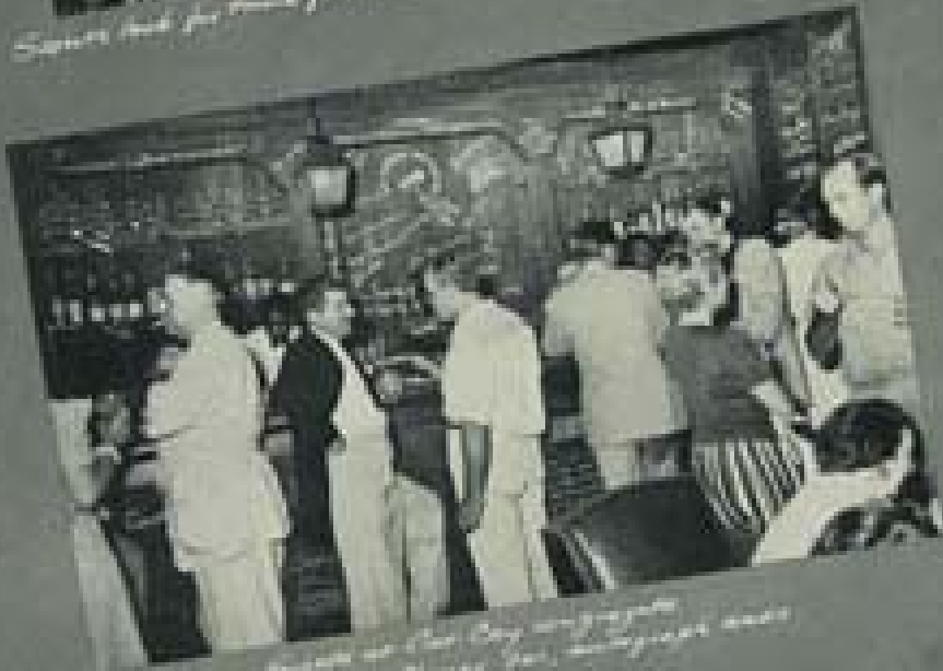
Party at Cat Cay with the in house bar and night club

SLIPPING TUNA THE LARGE BEAK, AUTOMATICALLY DRINK