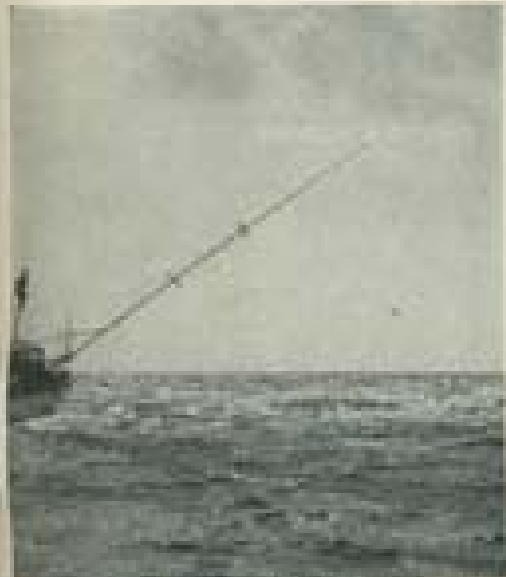
At the end of the day, the boat is out there, the trick is to keep back as far as possible pulling out up to six feet every forward stroke. The trick is the less time needed, used to work in that