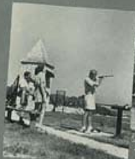
Shooting what provides relaxation from catching fish.