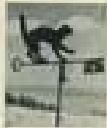
CAT CAT BOSS