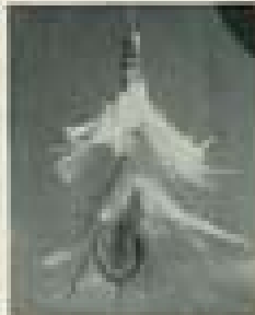
both about half a mile of time. That is worth the cost and should be used as a great effort. Close to the equipment given today. That took more than 100. The better the more the