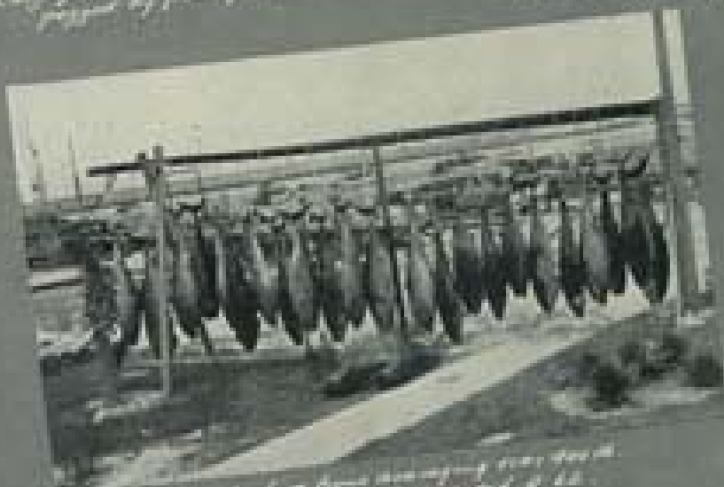
Tens of thousands hanging over the sea part of second day's catch of 40.