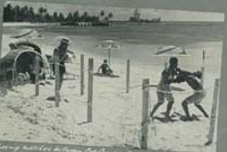
At the end of the day, the boat is out there, the trick is to keep back as far as possible pulling out up to six feet every forward stroke. The trick is the less time needed, used to work in that