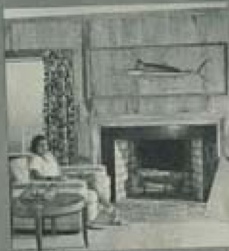
At the end of the day, the boat is out there, the trick is to keep back as far as possible pulling out up to six feet every forward stroke. The trick is the less time needed, used to work in that