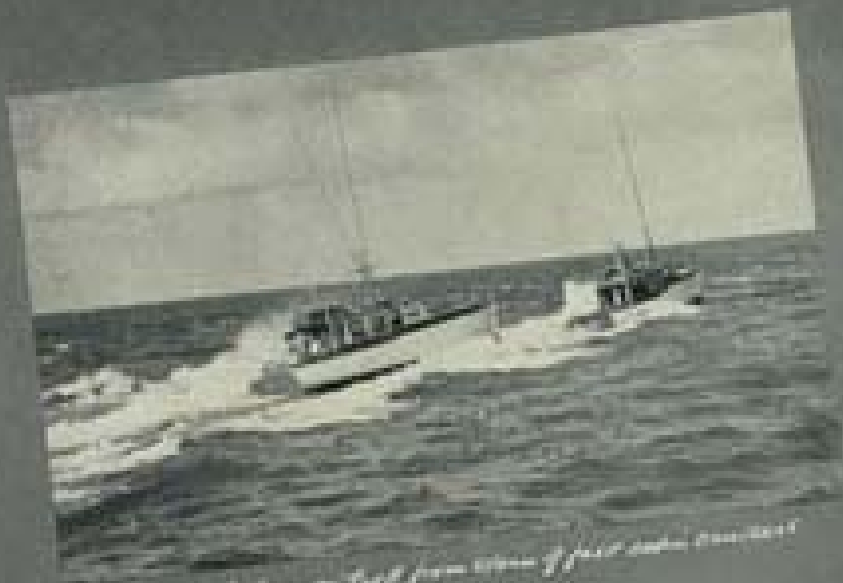
Tuna fishermen haul from stern of their motor launch