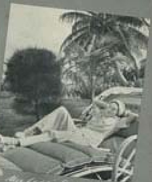
At the end of the day, the boat is out there, the trick is to keep back as far as possible pulling out up to six feet every forward stroke. The trick is the less time needed, used to work in that