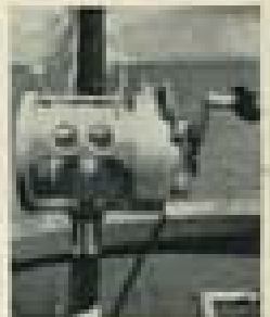
Deep sea reels cost about $100 to $150. They pull the line from the rollers to rollers inside the boat. Forward gear is left. Back equipped with broken and gear with way over 1000. The reel