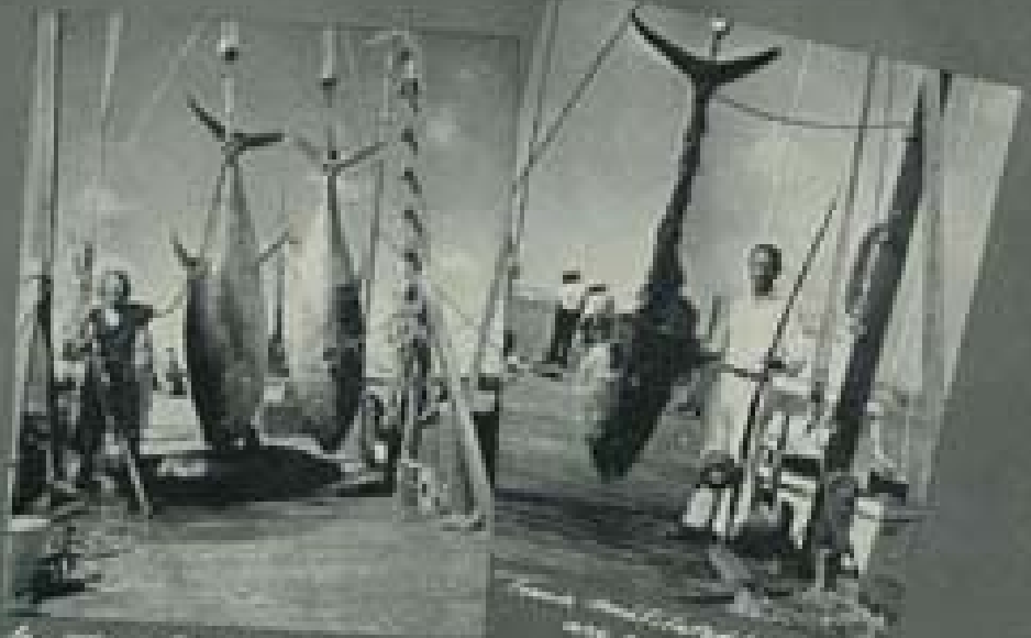
Two Tuna, Yellowfin and Common, they prize for tuna weighing 400 and 500 lbs.

TOP: BEYOND BY JUMPING, TUNA GIVE BIRTH RECORD.