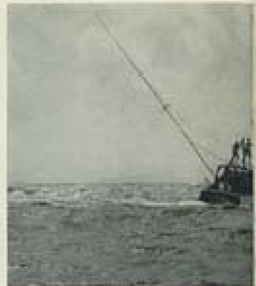
Well equipped deep sea fishing boat cost over $100,000. They go about 40 hours out from. Long price which look like investment can pay