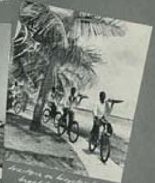
Swimming, bicycling and breakfast bring a leisurely day.