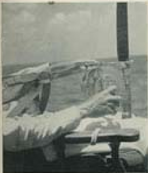
to succeed. When the boat is out there, the trick is to keep back as far as possible pulling out up to six feet every forward stroke. The trick is the less time needed, used to work in that